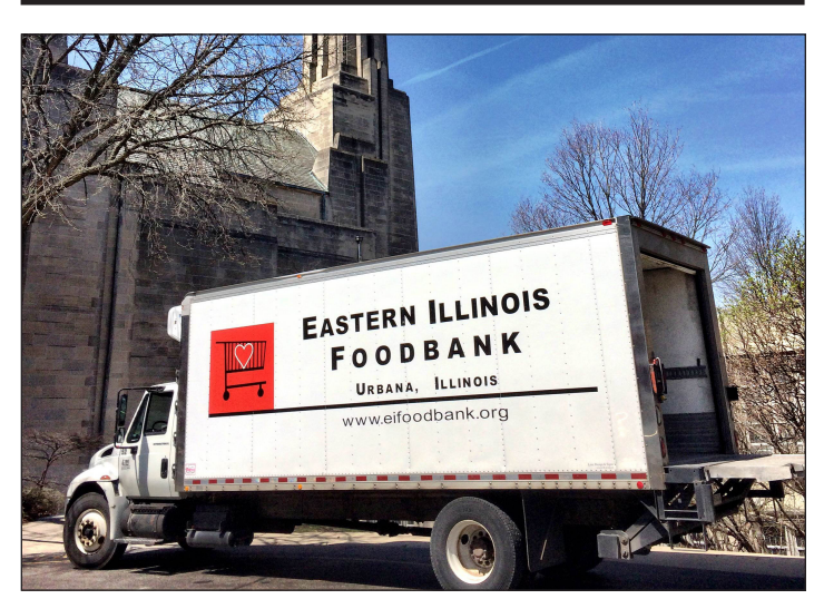
An Eastern Illinois Foodbank truck drops off food for a Thursday food distribution at Wesley.

A shout out to one of their ministries: They are seeking to clothe the community through their Clothing Exchange, a free clothing shop that offers individuals up to 20 articles of clothing. This ministry is on Tuesdays and Fridays this month from 2-4pm.